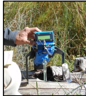
FROG-4000™ GC System.